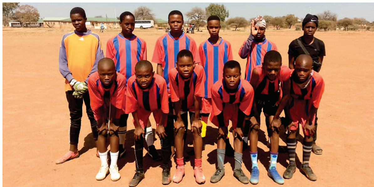
GTM Legend FC from Mogaladi Village are among football teams eyeing for the Bakone Sports Development Academy Super League title.