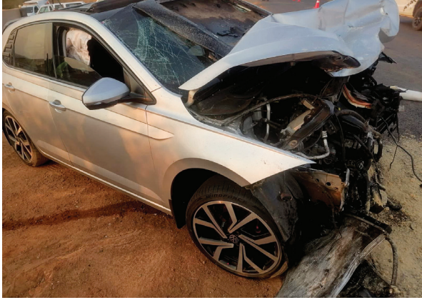
The driver of the VW Polo who was traveling alone, was rushed to Groblersdal Hospital for medical attention after his vehicle collided head-on with a Toyota Corolla, resulting in five people losing their lives.