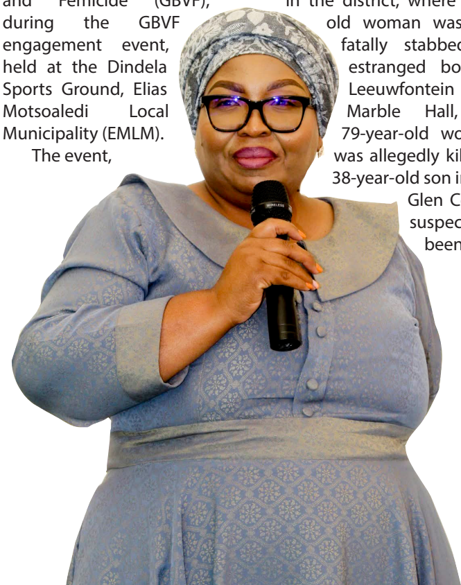
SDM Executive Mayor, Minah Bahula, announced that the upcoming Annual Heritage Day celebration will be held at Dindela Village.