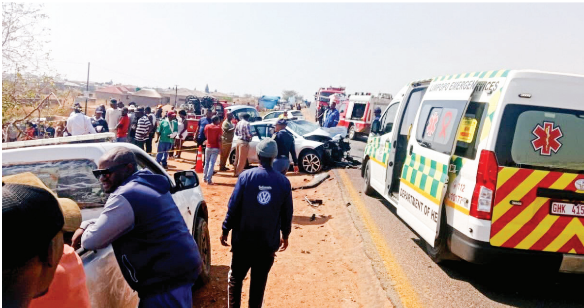
Emergency Medical Personnel attending the accident scene after a Toyota Corolla collided head-on with a VW Polo in Tafelkop Village. Five people perished during the accident.