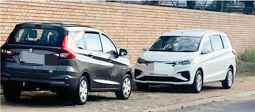
A 31-year-old scholar transport driver was arrested following after a pupil lost his life in a devastating accident occurred along the R555 Road next to Marikana Village in Roosenekal