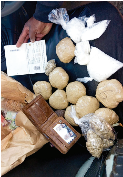
The police discovered various quantities of drugs during the ongoing Operation Shanela conducted across Limpopo Province.

LIMPOPO A total of 173 illegal immigrants were arrested during Operation Shanela, a joint operation conducted by the South African Police Service (SAPS) and other law enforcement agencies across Limpopo Province. The operation, which took place from Monday 18 August to Sunday 24 August 2025, resulted in the apprehension of 632 suspects for various offenses. According to Colonel Malesela Ledwaba, Limpopo Provincial Police Spokesperson, the operation led to significant arrests, including those who were nabbed for illegal possession of firearms, dealing in drugs, and contravention of the Immigration Act. "The men and women in blue have done an excellent job in ensuring that this province remains crime-free," said Ledwaba. He added that during the operations, law enforcement agencies, including the South African National Defence Force (SANDF), Department of Home Affairs (DoHA), Department of Social Development (DSD) and the Traffic Police, recovered various items, including 932.93 liters of alcoholic beverages, 35 ammunition, R61 in cash,