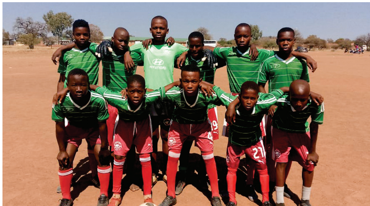
The experienced Ditlou FC from Makgatle Village are currently in the third spot of Bakone Sports Development Academy Super League and determined to win the competition.

MOOIHOEK - The Ratanang FC Sports Ground at Mooihoek Village in Tsimanyane, played host to an exciting football fever festival league games on Saturday 23 August 2025.