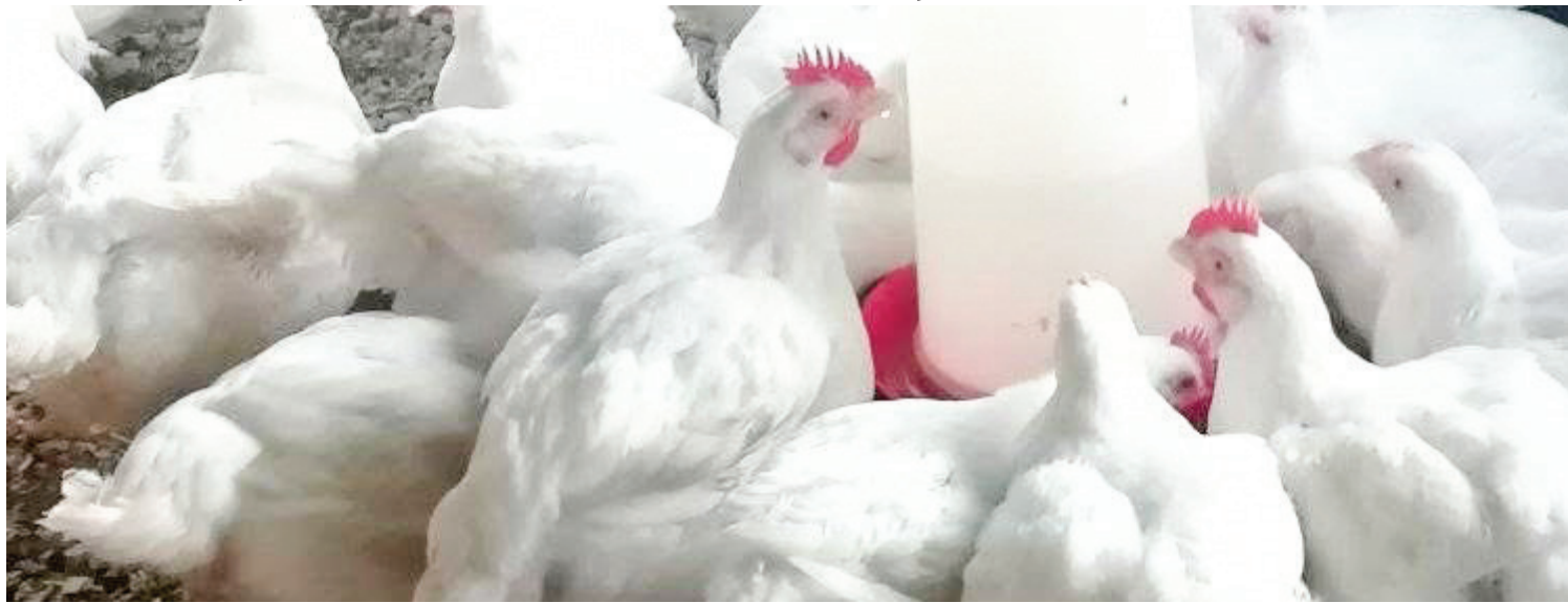
Pretty Poultry Farm focuses on broiler production, supplying fresh chickens to local consumers, street vendors, and resellers.