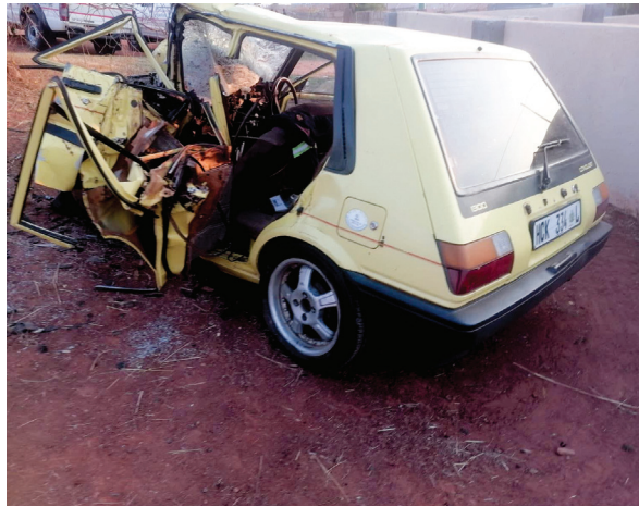
The Toyota Corolla which was carrying five passengers traveling who were all declared deceased on the accident scene.