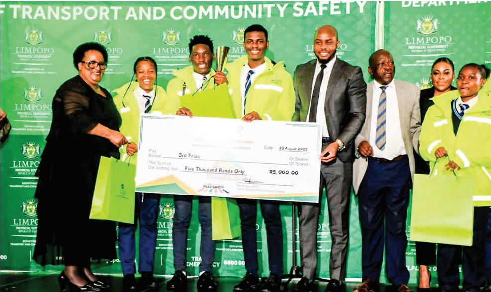
The announced Limpopo PET rejoicing as they will be representing the province in the upcoming national competition to be held in Gauteng.