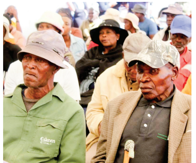
Dindela residents, including the elderly citizens, converged in numbers to attend the GBVF event at Dindela Sports Ground.